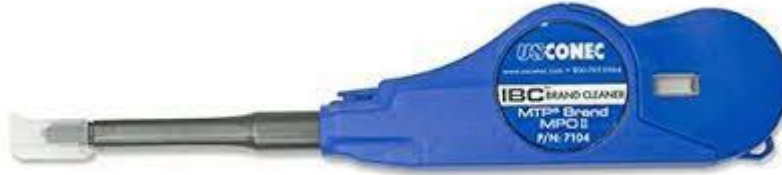
MTP® is a registered trademark of US-Conect Ltd.